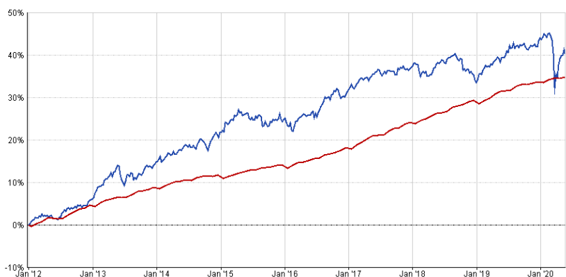
SINCE INCEPTION PERFORMANCE*

■ A - Defensive Mixed Assets 16/04/2020 TR in GB [40.37%] ■ B - UK Consumer Price Index + 2% TR in GB [34.78%]